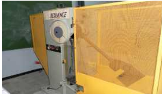
The resilience machine